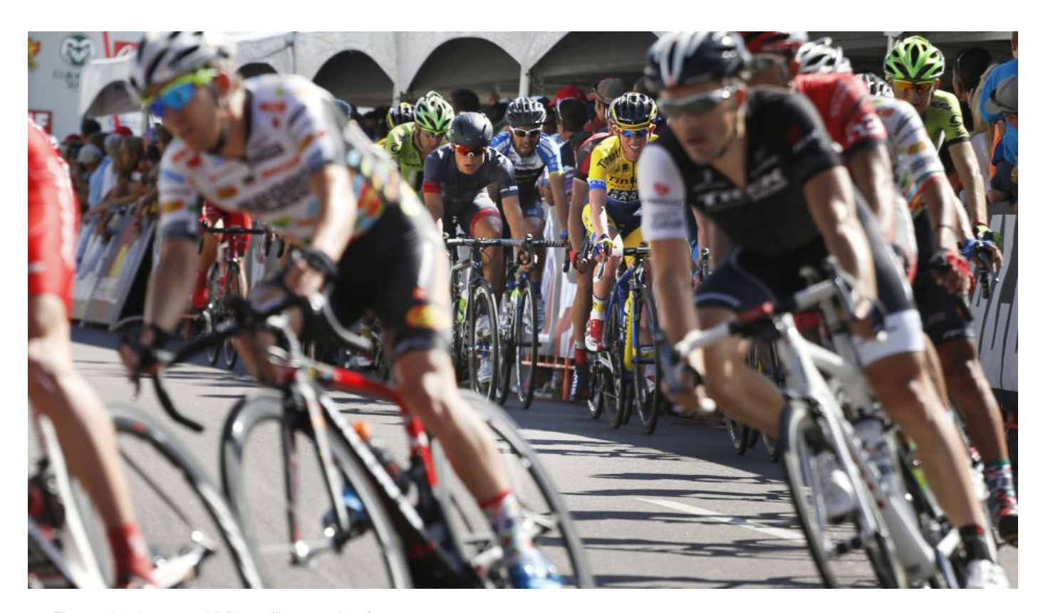
The road isn't yours.